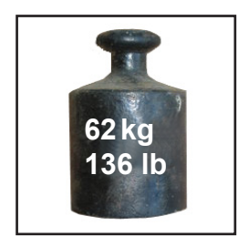
Lightweight and compact