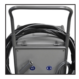
Integrated holding device for hose