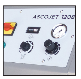
Control panel for easy overview