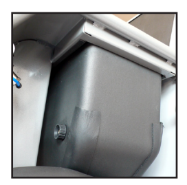
Insulated pellet hopper with 9 kg (19.84 lb) capacity