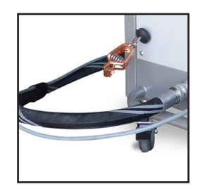
Integrated grounding wire for more safety