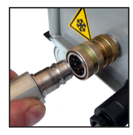
Quick connect coupling at blasting hose