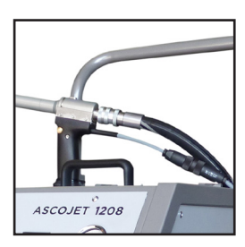
Vertically adjustable handle for easy handling